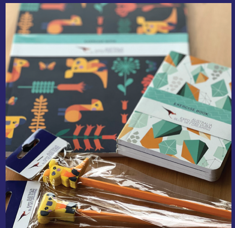
Australian Dubai Expo 2020