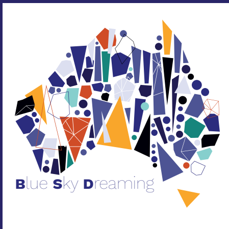
Australian Dubai Expo 2020

Mission. Thier mission is to build and develop Brands that have a long-lasting impact that is relevant in our ever-changing world. Their clients are, large & small size global corporations and local businesses they believe in, no matter the company size or location. Most of all, they love telling stories through branding . What will your story be?